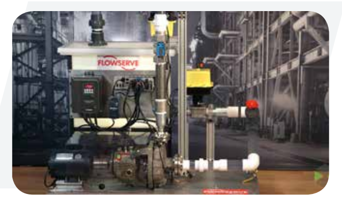
A Flowserve pump highlights the benefits of a digital twin.

The system model could also be instrumented using virtual sensors to measure, for