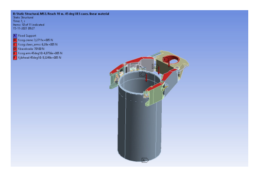
Figure 1. Example of design where Liftra use simulation for validation.