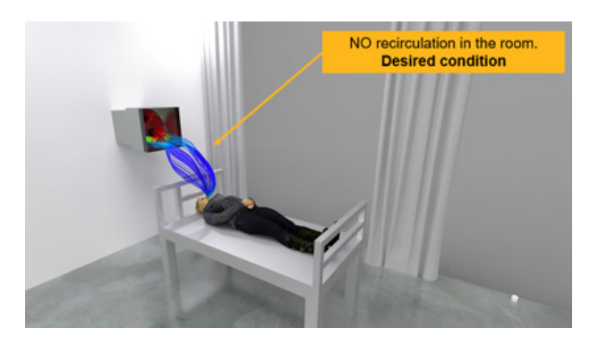
Figure 2: CFD predictions for recommended ventilation system design

with 45-degree louver at the inlet duct. The fan was modeled using a Markov random field (MRF) model to create the required suction. The pressure drop across the HEPA filter was modeled using the porous media model.