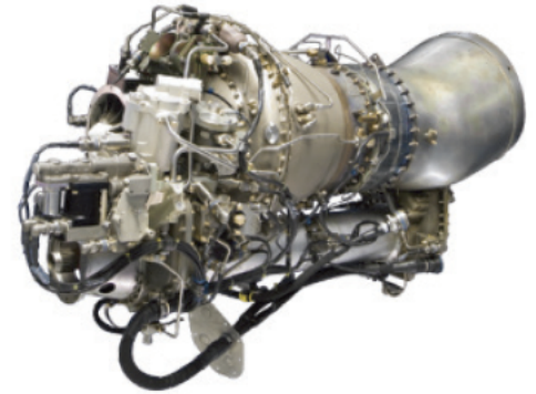
Arriel 2-D Engine.

Turbomeca, part of the Safran group, is the world's leading producer of helicopter engines and has produced more than 70,000 engines since its founding in 1938. The company specializes in the design, production, sale and support of low- to medium-power gas turbines to power helicopters.