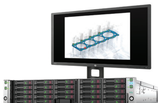
HPE Apollo 2000 Gen10 System

Turnkey, fully managed HPC clusters for CAE