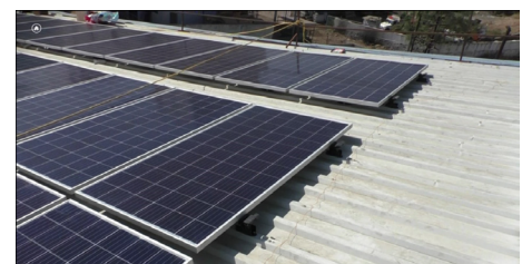
Indian commercial rooftop solar project installation using Tesseract™ Z. This picture shows the final look of solar panels and mounting hardware installed on the roof.