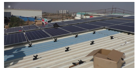
Indian commercial rooftop solar project installation using Tesseract™ Z. This picture shows that mounting hardware is installed in place for this solar panel row.