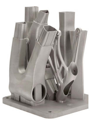
AM part image courtesy of Renishaw plc.