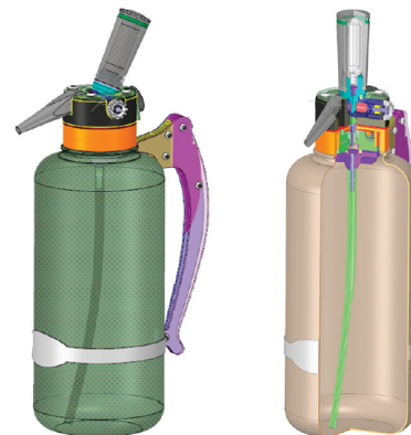
Figure 3. Billet Designs complete CO2 beverage growler head system. Billet found SpaceClaim's manipulation and rendering capabilities particularly useful.