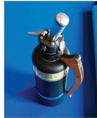
Figure 1. Billet Designs CO2 beverage growler head, designed entirely in SpaceClaim.