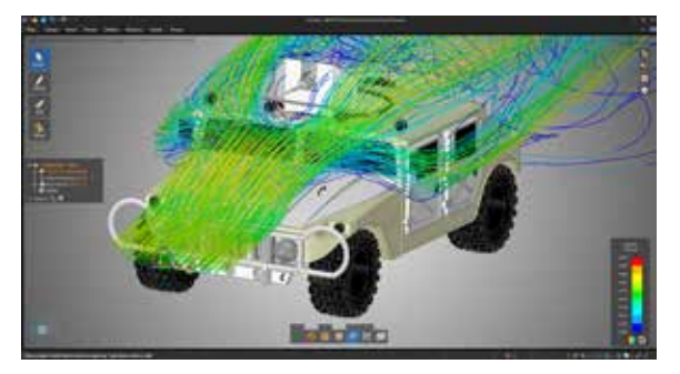
Discovery Live can easily switch between physics — from the external airflow around a vehicle to the mechanical stresses on the same vehicle — in seconds.

products. That is why it's called ANSYS Discovery Live: For the first time, every engineer will have the power of live experimentation to help them discover and unlock the next big idea.