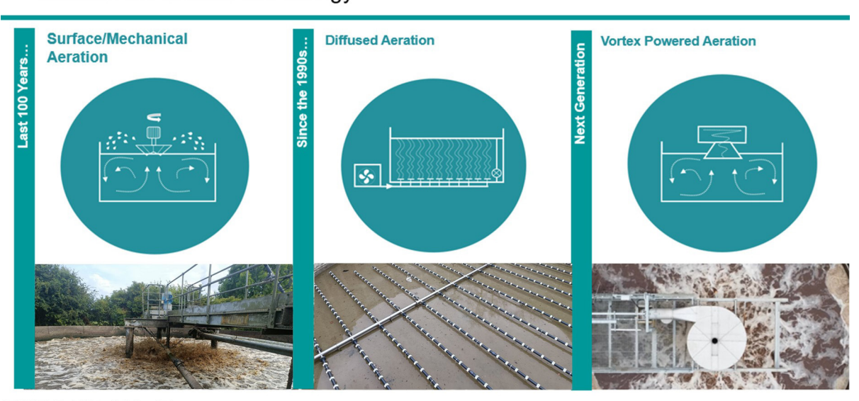
© 2024 VorTech Water Solutions Ltd Strictly Private and Confidential