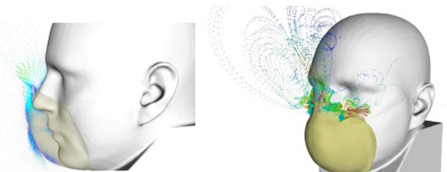
Figure 3: Flow distribution inside of the loose-fitting mask and flow leakage near the nose (left); and streamlines emerging from gaps between face and mask (right).