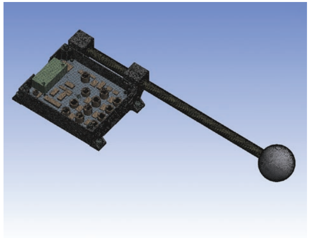
▲ DSLP model, 7.6 million DOF GEOMETRY COURTESY SVS FEM S.R.O.