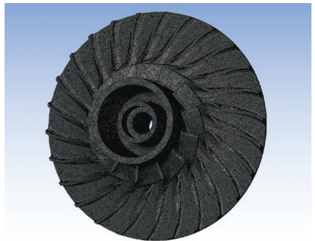
▲ Radial impeller cyclic symmetry model (visually expanded) GEOMETRY COURTESY PADT, INC.

For example, a block Lanczos cyclic symmetry modal analysis of a radial impeller was solved on a two quad-core Intel® Xeon® E5530 (Nehalem architecture) workstation. (This chip was made available in early 2009.) By today's standards, this CPU is a few generations behind. However, using an NVIDIA® Quadro® 6000 card with GPU acceleration, you can obtain significant speedup without having to replace the entire workstation.