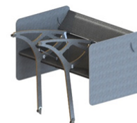
The designed structure is integrated into the rear wing assembly; inserts and stepwashers were made to complete the design of the rear wing.