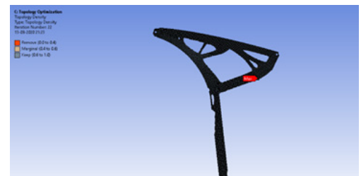
Topology optimization was performed on the design, and the result was exported into SolidWorks to make refinements. A structural simulation was re-run on the refined design to check for safety factor.