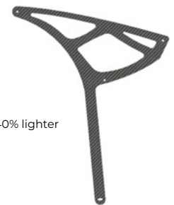
The final design, which is 40% lighter than the first design.