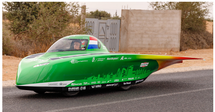
The solar car Green Spirit in Morocco.

Simulation also allows TDSR to improve on design concepts introduced in previous editions while ensuring that all regulations are being followed. By using software provided by Ansys every year, the team can improve their SPEV edition after edition.