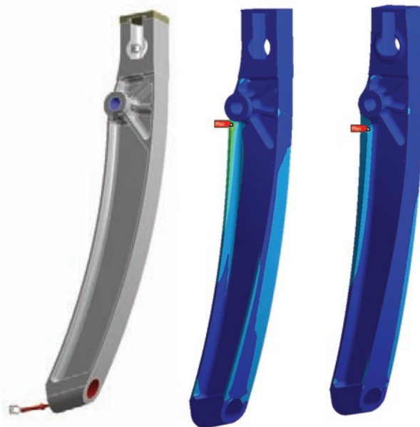
Pedal failure corresponding to the ANSYS stress plot, showing how the model was restrained and loaded: loads and constraints (left), original design (middle) and optimized design (right)