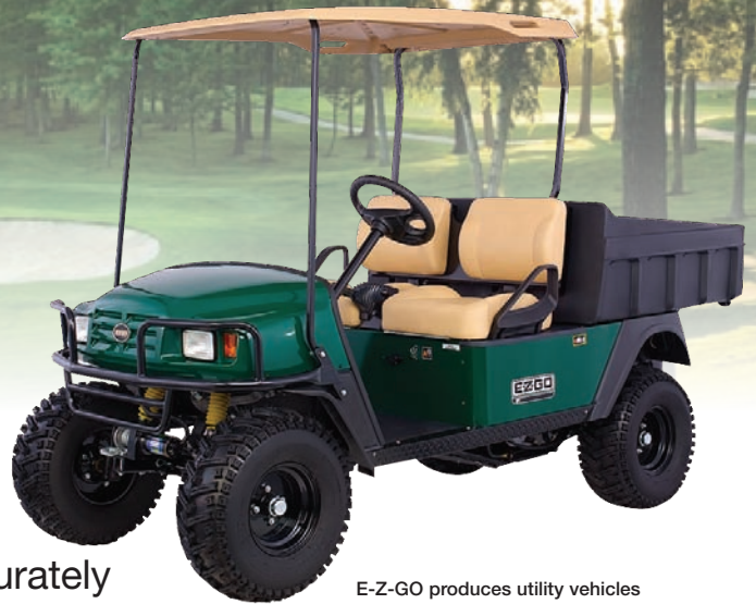
E-Z-GO produces utility vehicles that can be used to haul materials over rough terrain.

E-Z-GO engineers quickly and accurately design a reliable utility vehicle part that saves manufacturing costs.