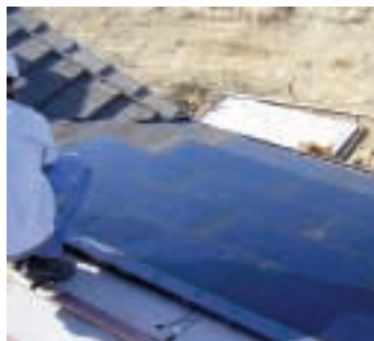
Open Energy solar panels being installed

Open Energy Corp. of Solana Beach, California, has overcome these drawbacks with SolarSave® panels — a solar roof solution unlike anything previously available in the industry. Panels are designed to integrate and interweave with standard roofing tiles so as to blend in with the roof, an important consideration in subdivisions with strict homeowner bylaws pertaining to roof profiles and solar panel installations. These integrated panels are also cost-effective, as they are installed as tiling over part of the roof rather than as an add-on above traditional coverings. The lightweight panels are warranted for 25 years, are easily handled, and can be walked on, simplifying installation for roofing contractors and solar integrators.