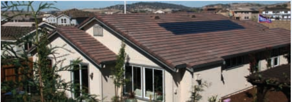
Open Energy SolarSave® panels are designed to integrate and interweave with standard roofing tiles so as to blend in with the roof profile and color.

By Matthew Stein, President, Stein Design, California, U.S.A.