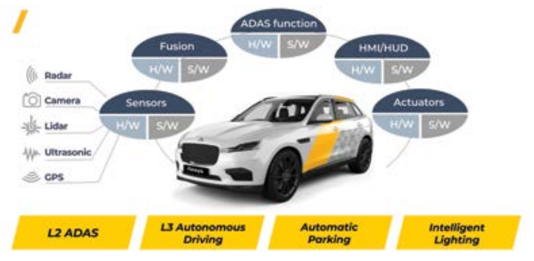
The Ansys VRXPERIENCE Driving Simulator powered by SCANeR is the basis for ADAS and the continuum all along the ADAS development cycle.

Another example is an emergency braking function that is part of an ADAS. To develop it, the function is first described as a model, often in MathWorks Simulink or Ansys SCADE Suite. It is tested to meet objectives and then designed as a more detailed model. The coding of the emergency braking function can then be tested vs. scenarios with softwarein-the-loop and hardware-in-the-loop.