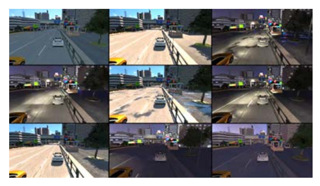
Ansys VRXPERIENCE Driving Simulator powered by SCANeR automates scenario variability creation for massive simulation.